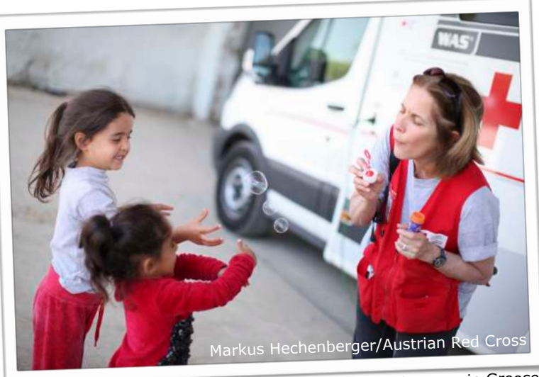
Austrian RC volunteer assisting children in a migrants camp in Greece

The role of the RCRC Movement on migration is strictly humanitarian, and focuses on the needs, vulnerabilities and potential of migrant people, regardless of their legal status. The RCRC Movement does not encourage or discourage migration, but instead seeks to ensure that vulnerable migrants, including refugees and asylum seekers, receive the protection to which they are entitled under international and domestic law.